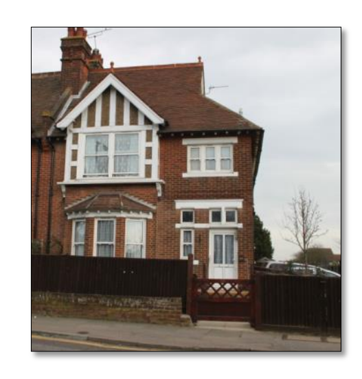
Canterbury ASU – Canterbury 5 Bedded Unit