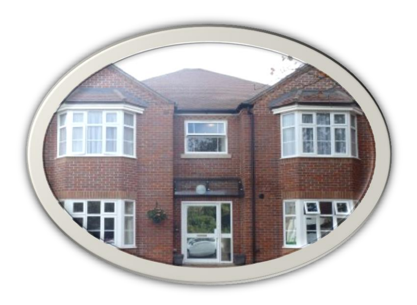
Rusthall Respite, Tunbridge Wells 5 Bedded Unit