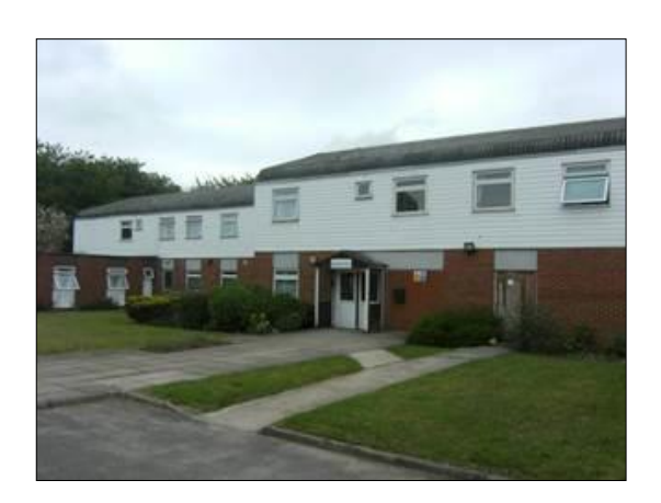
Osborne Court – Faversham 13 Bedded Unit