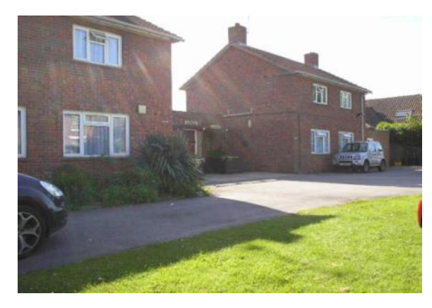
Hedgerows Staplehurst 5 Bedded Unit