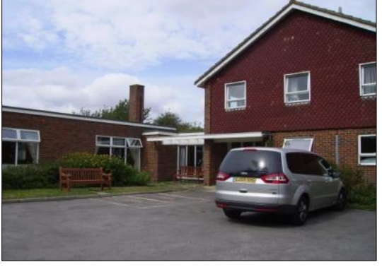
Southfields – Ashford 15 Bedded Unit