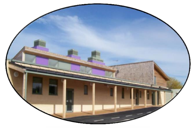
Windchimes – Herne Bay 6 Bedded Unit Jointly funded by KCC and Health Authority