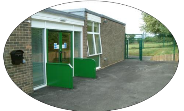
Bluebells – Maidstone 4 Bedded Unit